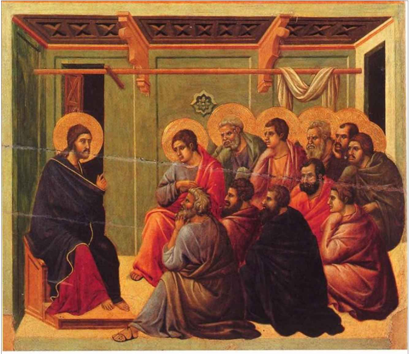
Jesus' Farewell Discourse, Duccio di Buoninsegna, Italian, 1255-1318