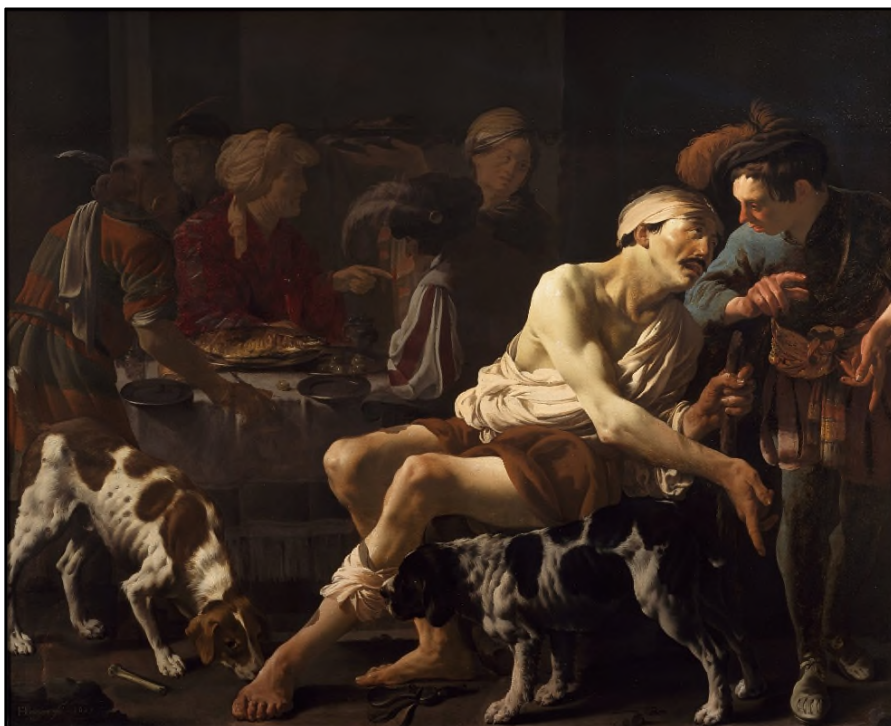
The Rich Man and the Poor Lazarus , Hendrick ter Brugghen, 1625, Centraal Museum Utrecht, Netherlands

518-374-3163 • www.stgeorgesschenectady.org • Email: office@stgeorgesschenectady.org