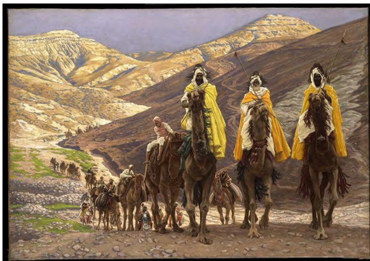
Journey of the Magi, James Tissot, circa 1894

518-374-3163 • www.stgeorgesschenectady.org • Email: office@stgeorgesschenectady.org