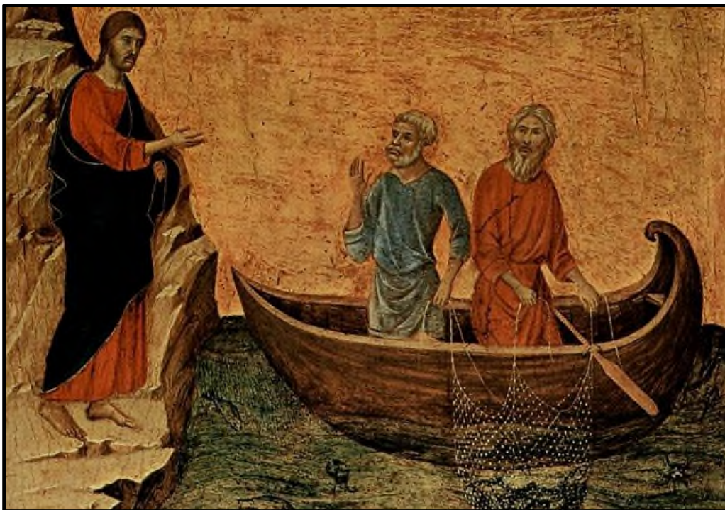
The Calling of the Apostles Peter and Andrew (from the Maestà) c.1308–1311

518-374-3163 • www.stgeorgesschenectady.org • Email: office@stgeorgesschenectady.org