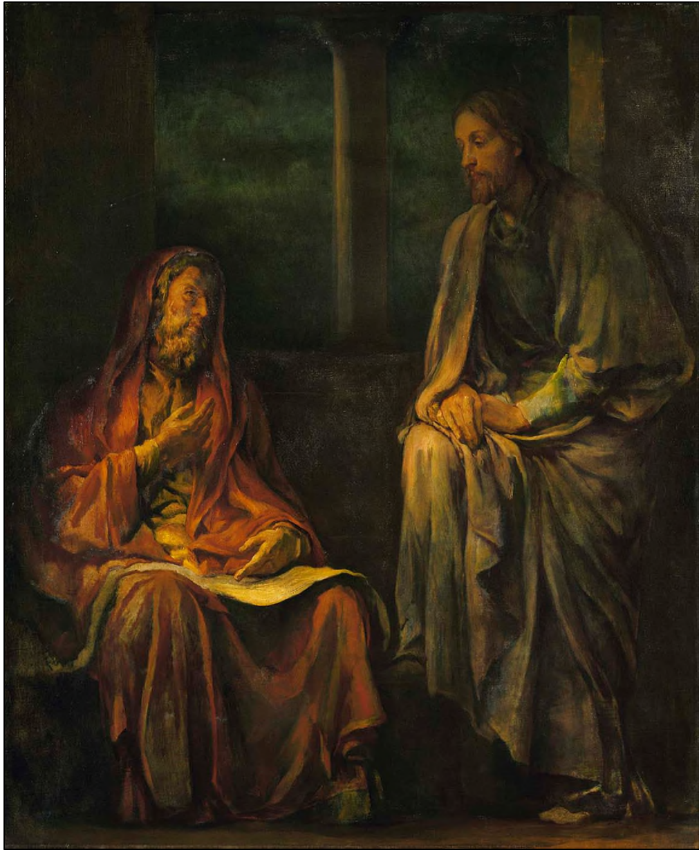
Visit of Nicodemus to Christ John LaFarge, (1835-1910), oil on canvas