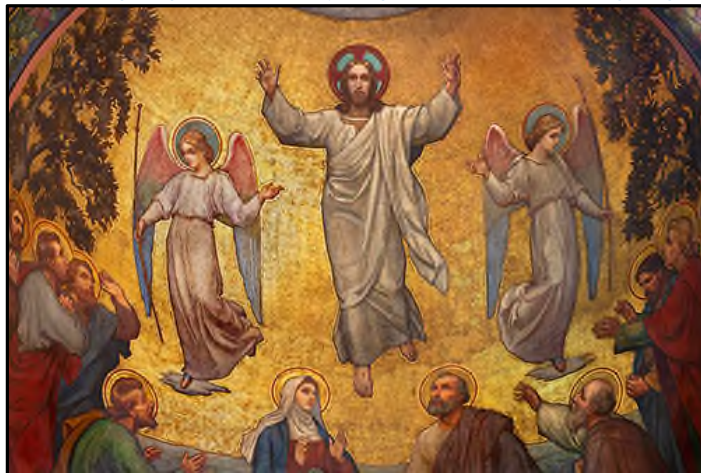
Fresco of Ascension of Jesus, Kostel Svatého Václava in Prague by S. G. Rudl, 1900

518-374-3163 • www.stgeorgesschenectady.org • Email: office@stgeorgesschenectady.org