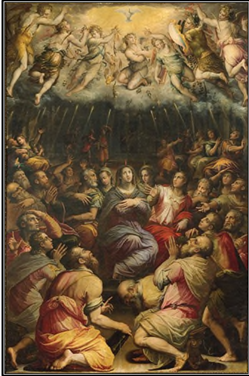
Pentecost, Giorgio Vasari, 1574, Metropolitan Museum of art