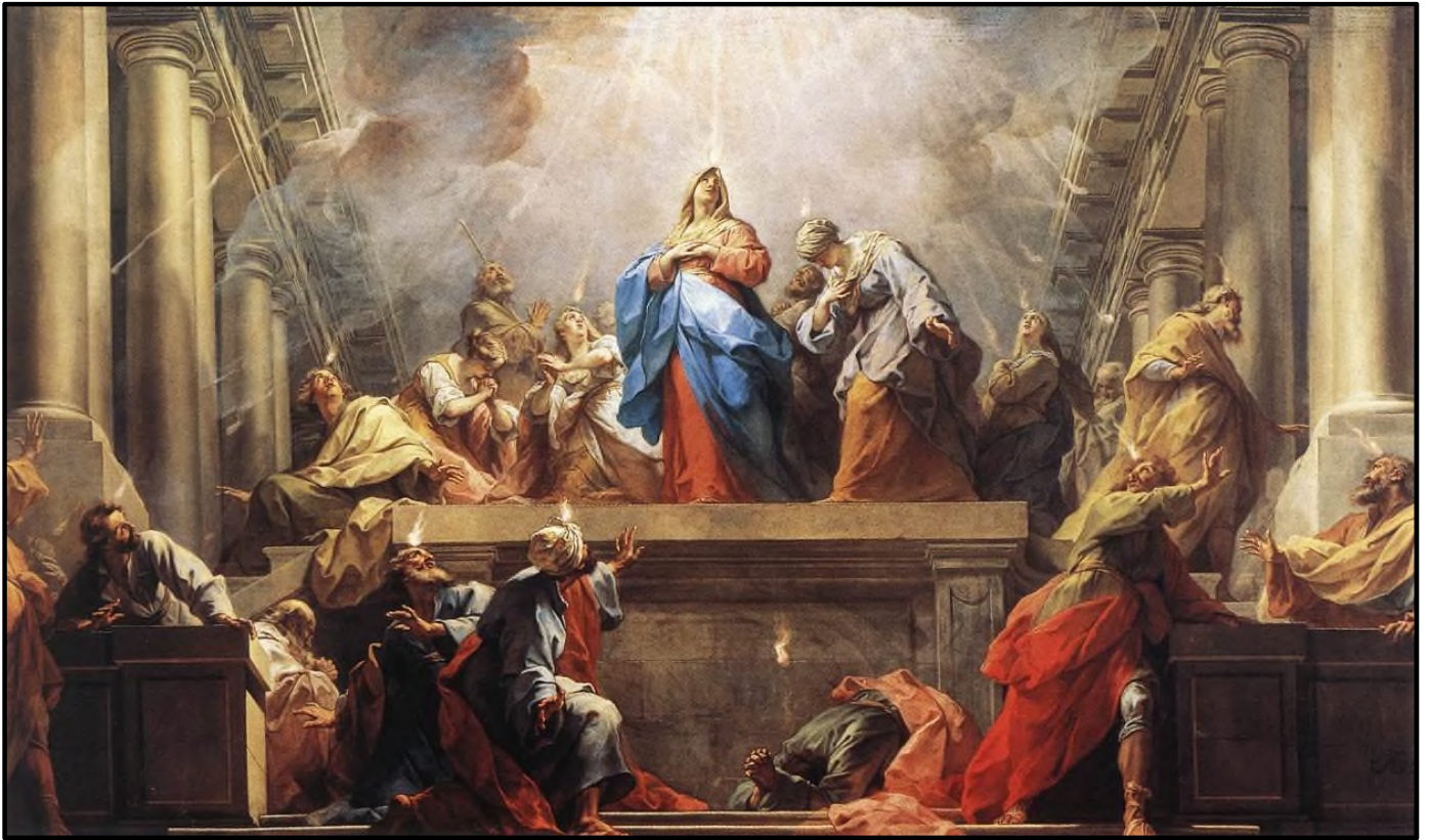
Pentecost , Jean II Restout, French, oil on canvas, 1732